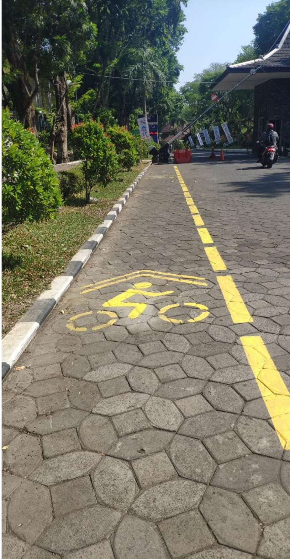
Figure 7. A Bicycle line is also provided by the university in order to encourage the safety of the bicycle riders