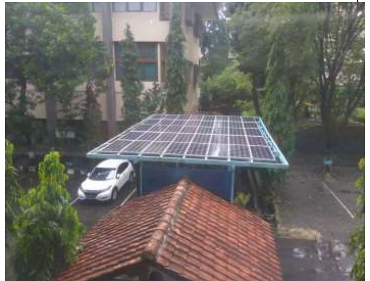
Figure 4. During 2018, UNS has received Grant in cooperation with the Toyota, for pilot project of implementation of 2 electric cars. In accordance with this activity, UNS also received electrical power charging station, which spreadly in 4 locations in UNS. A Charging facility has also been installed in 4 spots, for each of 2 spots have been able to recharge 8 units of electrical bikecycle Ev or 2 units of car EV for fast charging. For the infastructure which is located in Engineering Faculty, this has been provided wth the blue display/ interface and has been integrated with solar panel.