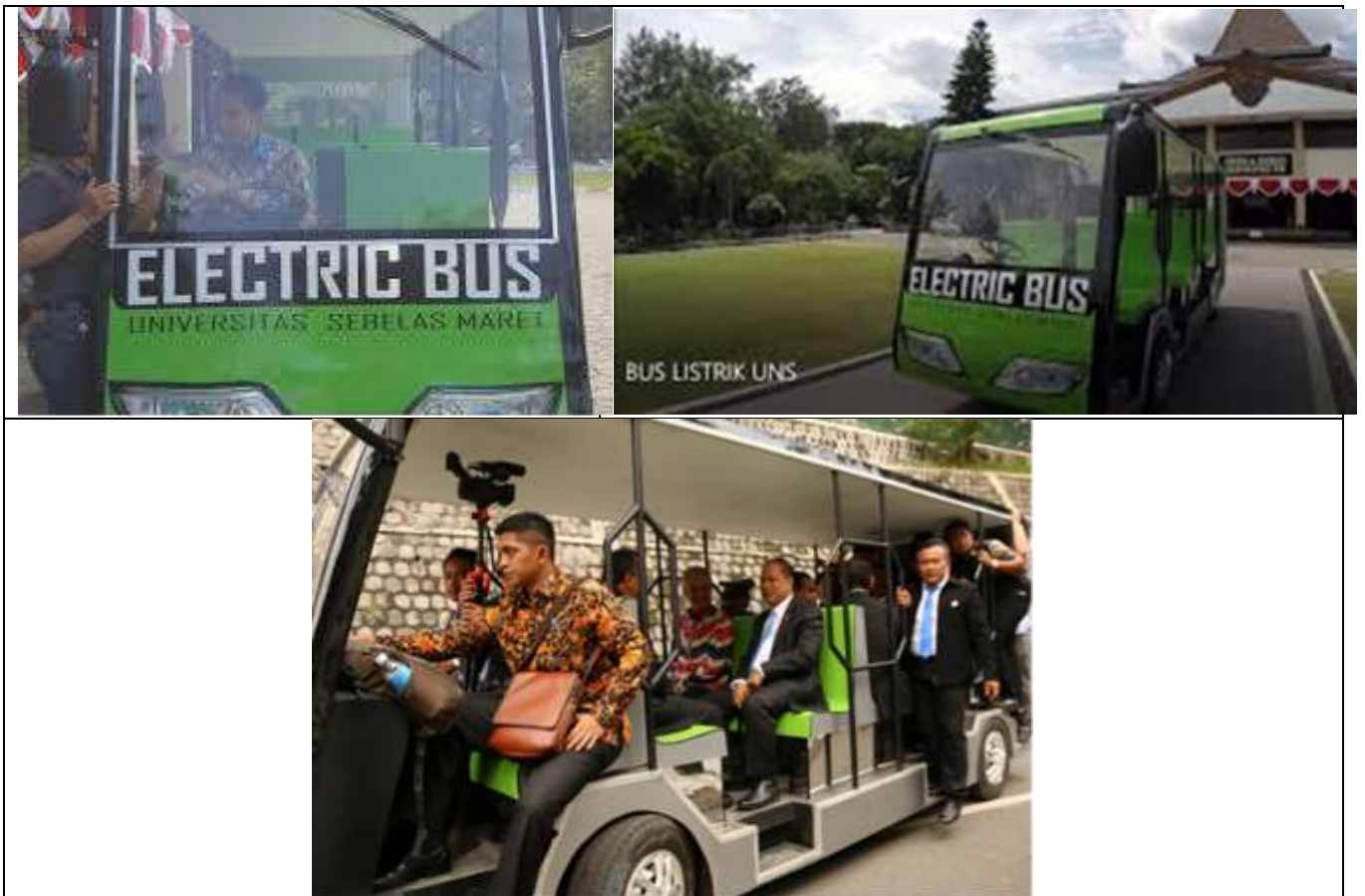
Figure 3. Electric Bus is usually operated during special events in UNS