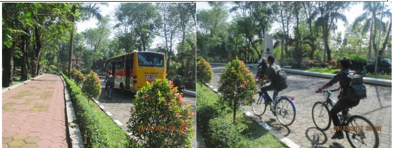
Figure 2. Some students and civitas academica ride a bicycle in campus area of Universitas Sebelas Maret, Indonesia