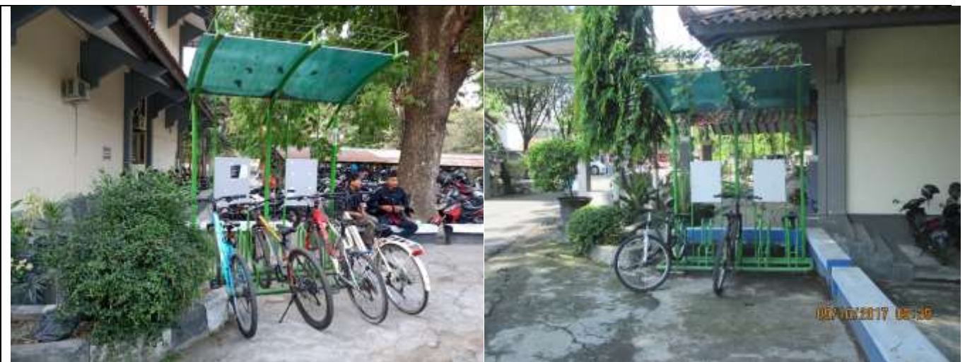
Figure 1. Universitas Sebelas Maret, Indonesia provides Bicycle Parking in 14 spots for students and academic staff