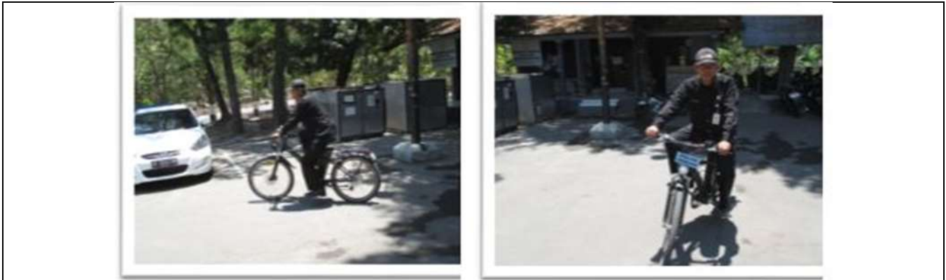
Figure 5. The use of the Electric Bike(E Bike) by the security staff in duty. .