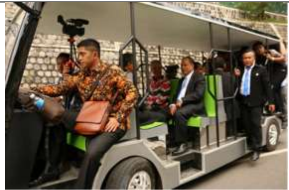
Figure 2. Electric Bus is usually operated during special events in UNS