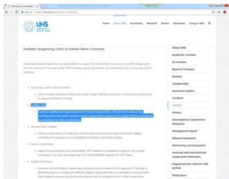
Figure 6. Example of Shuttle service is available

There are several types of shuttle services operated in Universitas Sebelas Maret: 1) Campus Bus, which operates for free every day from Monday to Friday 07.00 -16.00 with loop rute started from UNS front boulevard –Rectorat Building- Engineering Faculty Building- Economi and Business Faculty Building- Faculty of Social-politic building- Law Faculty building- Posgraduate Faculty building – back boulevard- Mahtematic and Science Faculty Building – Agriculture Faculty Building – Rectorat Building and ended in the front of boulevard; 2) There is an Electric Bus operated in UNS, which usually ride in special National events in UNS.