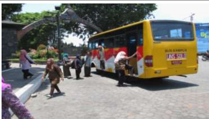
Figure 1. Bus Campus has been operated for free in UNS and connected to the public transport