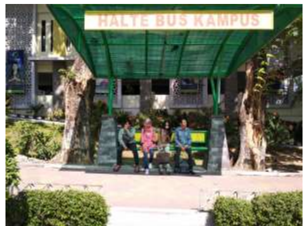
Figure 4. Campus Bus Stop