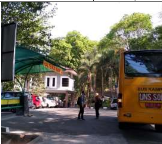
Figure 3. Campus Bus Stop Connected all faculty in UNS