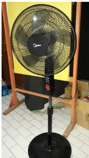
Figure 3. The use of fan with energy efficiency technology