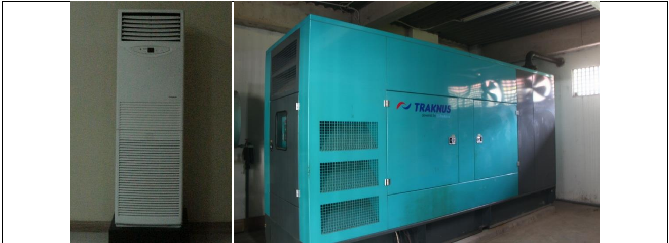
Figure 5. Some Efforts of UNS in renewing the old equipment into energy efficient appliance usage such as : Air Conditioning in Meeting Room UNS Inn, Environmental Friendly Genset in Faculty of Medicine, etc. .