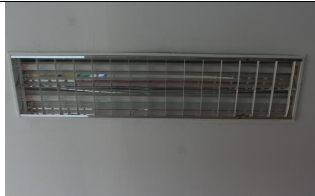
Figure 2. The use of light reflector for maximizing in door light.