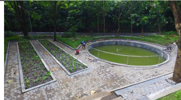
Figure 3. One of Control Ponds in Domestic Waste Water Treatment Instalation Universitas Sebelas Maret, Indonesia