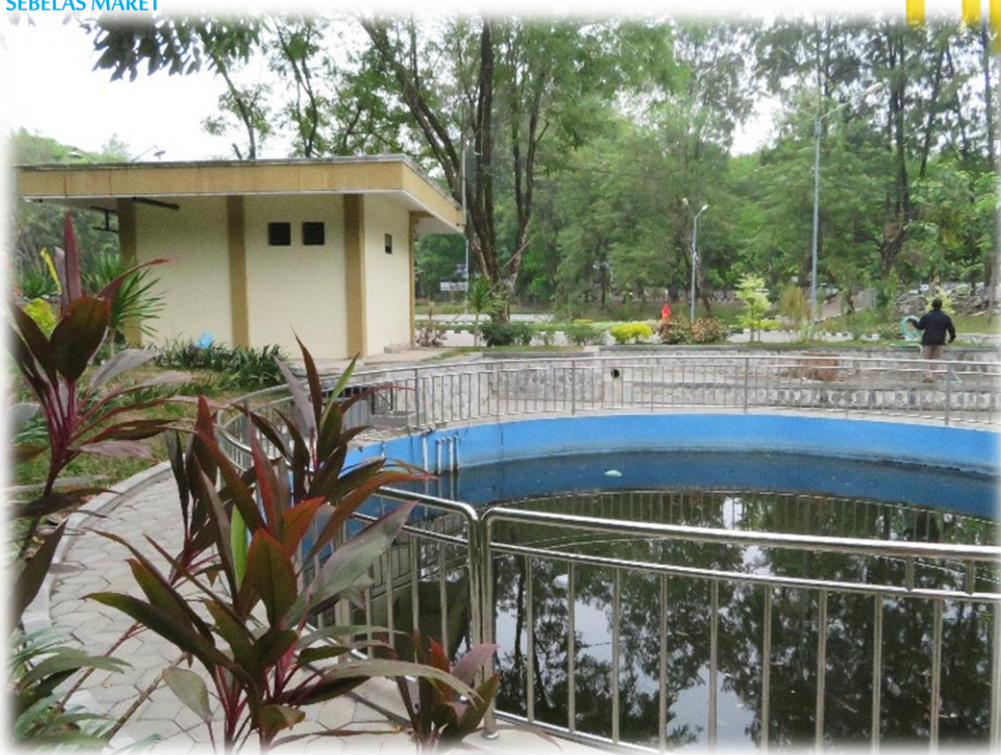
Figure 2. Recycle Water Pond resulted from the process of Domestic Waste Water Treatment Instalation Universitas Sebelas Maret, Indonesia