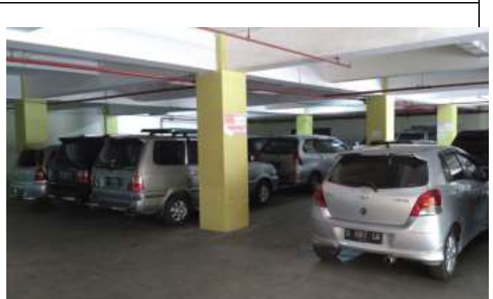
Figure 4. Basement Parking Space is provided in UNS Inn building in Universitas Sebelas Maret, Surakarta