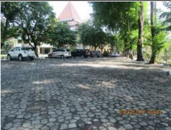
Figure 1. Open Space Parking In Universitas Sebelas Maret, Surakarta