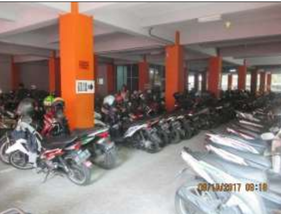
Figure 3. some faculties in Universitas Sebelas Maret, Surakarta have Building Parking space / basement parking space