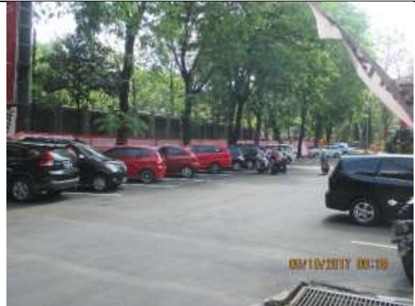
Figure 2. Open Space Parking In Universitas Sebelas Maret, Surakarta