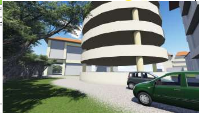
Figure 5. Location of Future Plan of Vertical Pooling parking spaces in UNS