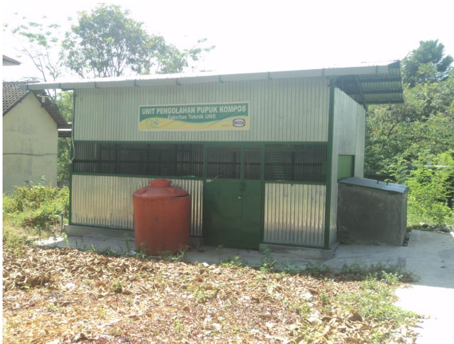
Figure 1. Composting Unit