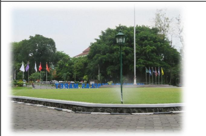
Gambar 03: Garden water spinkler system uses water efficient appliance.