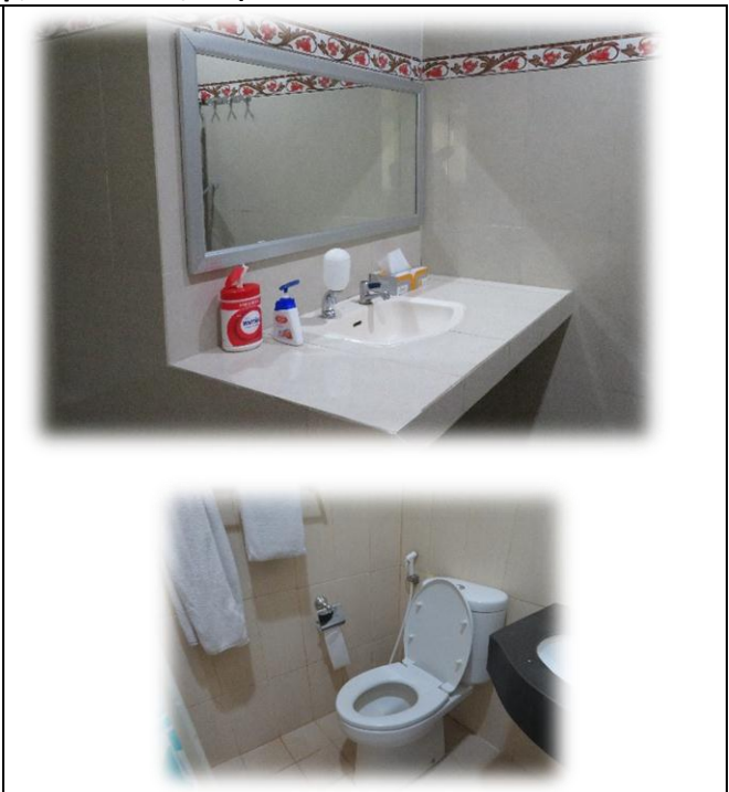
Figure 02: Water efficient appliances have also been used in authomatic stopped water tap in wastafel and Toilet flush