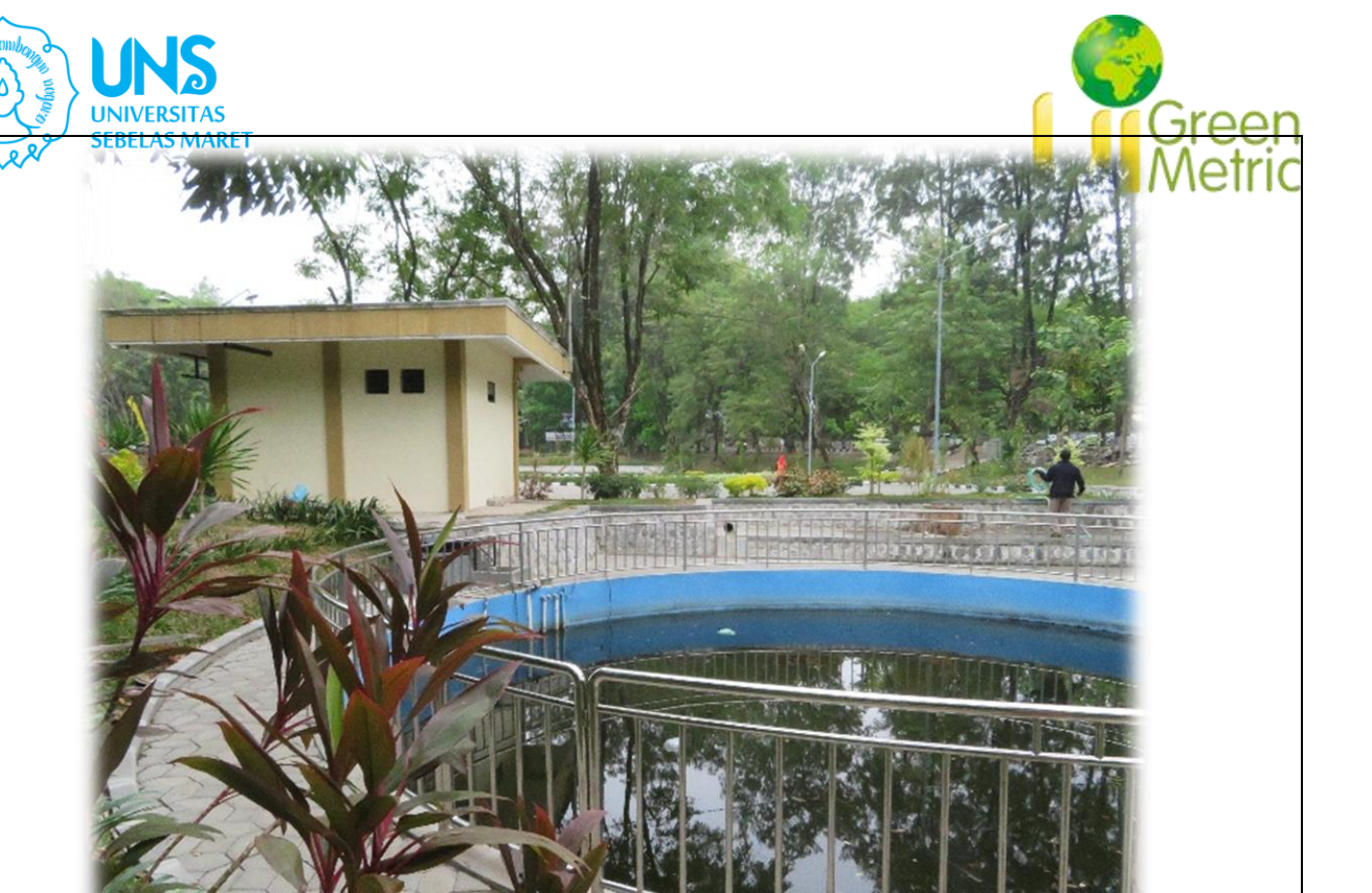
Figure 2. Recycle Water Pond resulted from the process of Domestic Waste Water Treatment Instalation Universitas Sebelas Maret, Indonesia