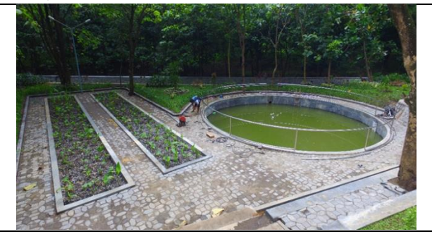
Figure 3. One of Control Ponds in Domestic Waste Water Treatment Instalation Universitas Sebelas Maret, Indonesia