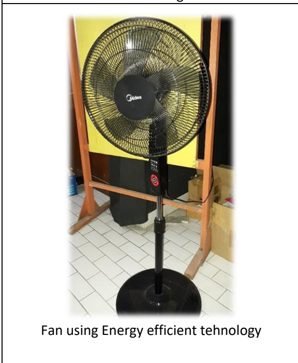
Fan using Energy efficient tehnology